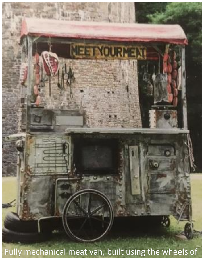
Fully mechanical meat van, built using the wheels of an old wheelchair. Scrap metal, cladding, oven parts and rusting powder were some of the items used to construct the van.