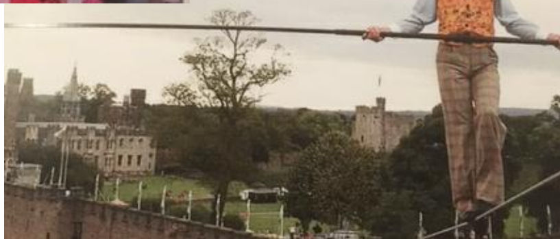
Roald Dahls' City of the Unexpected: 30 Fantastic Mr Fox masks were made for various talent acts taking place across Cardiff city, including tightrope walking and escapology. Taken from a silicon mould.