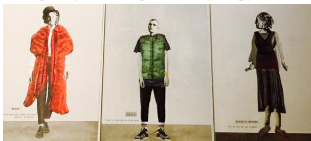
Costume, Conceptual Set and Costume Design